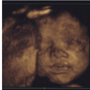
3D Baby Scan