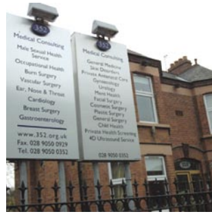
352 Lisburn Road