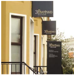
6 Lisburn Road