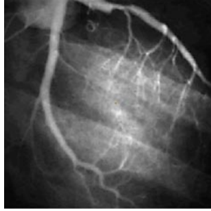
CT Coronary Angio image