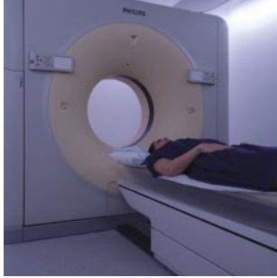
64 Slice CT scanner